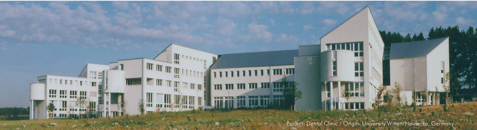
Project: Dental Clinic / Origin: University Witten/Herdecke, Germany