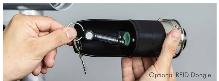
Optional RFID Dongle