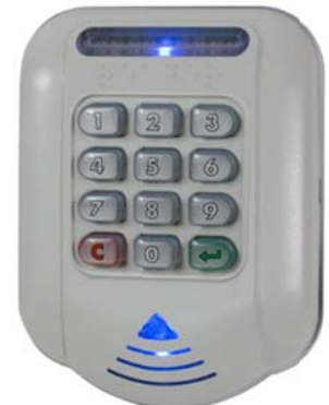
CDx 5 K